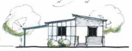
TYPICAL PARK HOME ELEVATION SCALE 1:100