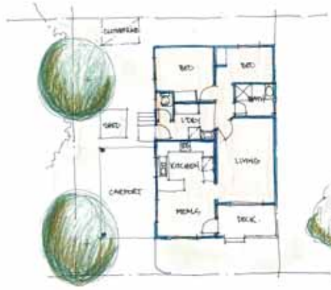
TYPICAL PARK HOME PLAN SCALE 1:100